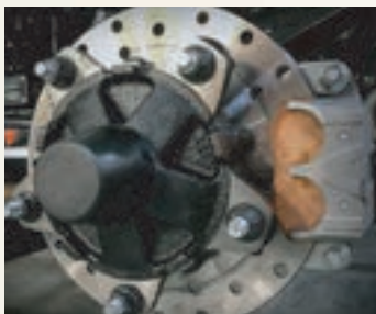
HYDRAULIC DISC BRAKE

Available in KIOTI red or green and with a choice of wheels & tyres, the K9 can be easily customised.