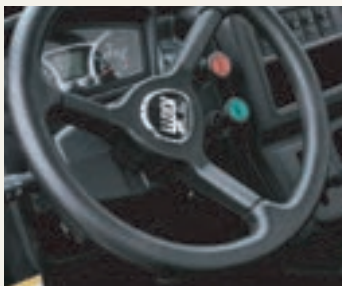
ELECTRIC POWER STEERING

In addition to the features found on the K9 2410U-EU, the 2410C-EU is equipped with rear headrests and floor mat. There are many options. The manual load deck tipping can be upgraded to electric for easier operation.