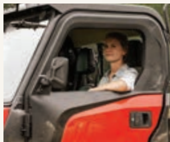
FACTORY FITTED CABIN

The speed proportional electric power steering (EPS) gives more responsive steering. The faster the speed the more resistance the driver feels through the steering wheel.