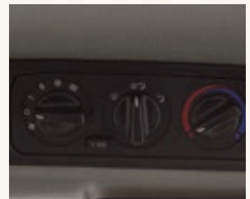
AIR CONDITIONED CABIN

The engine brake works with the CVT transmission to provide additional braking, especially useful when descending hills loaded or towing.